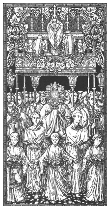
The Most Holy Sacrament

THE FEAST OF CORPUS CHRISTI 7th JUNE 2026