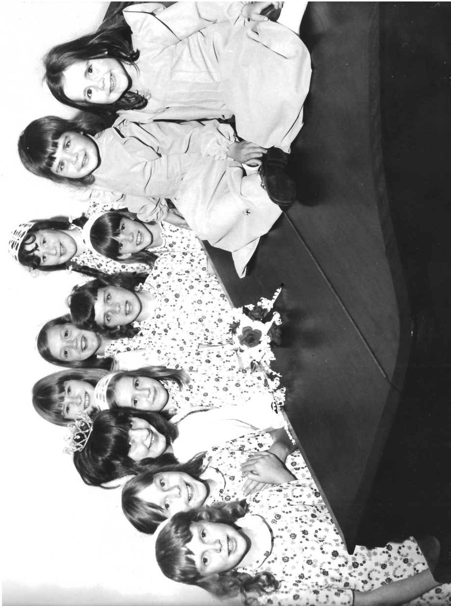
Social events organised for the Rose Queen at successive village carnivals were popular and here several of our Sunday School pupils are pictured at one such an event in the Community Hall