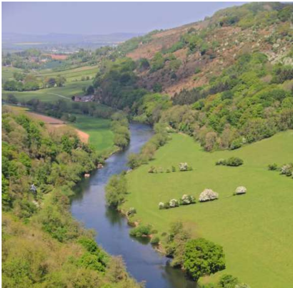
Symonds Yat—River Wye

A magazine for the villages of Galhampton, North Cadbury, South Cadbury & Yarlington in the Vale of Camelot Churches