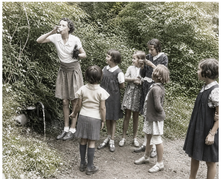
Petworth. Evacuees at the Virgin Mary Spring. September 1939.

The spring appears on the first edition Ordnance Survey maps of the late nineteenth century, showing that it has been recognised for well over a century. Although little documentary evidence survives, its dedication to the Virgin Mary suggests a much older origin, possibly dating back to medieval times when holy wells and sacred springs were important places of local devotion and pilgrimage.