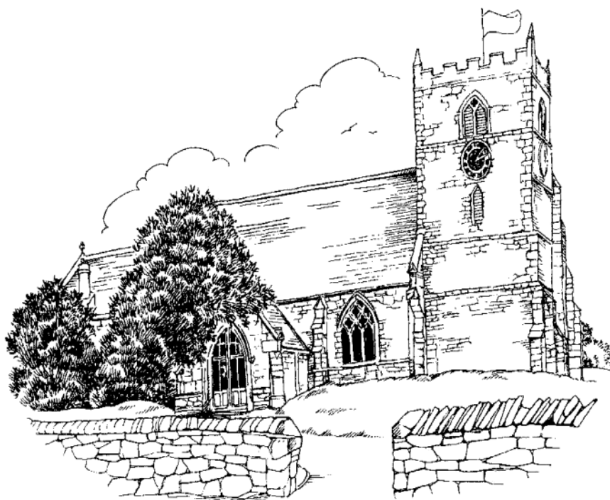
St. Philip & St. James Church, Ratby

Ratby Parish Church is committed to the safeguarding, care and nurture of everyone within our community.