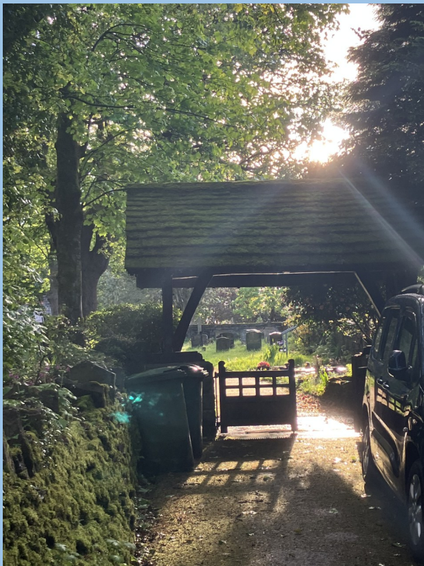
Ascension Day evening approaching Rivington Church