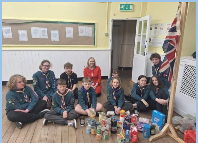
6th Horwich Scouts who worked to support Urban Outreach with food parcels, menu planning, making temporary shelters and after that they delivered 600 Christian Aid envelopes! Well done!