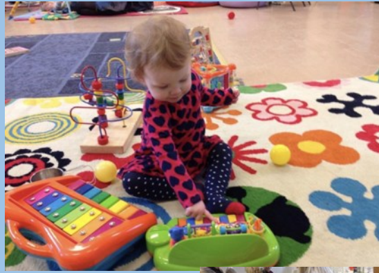
Clockwise from left: Time 4 2s Forest School; playtime and Nativity. And below right the Ukelele Band who played at St Catherine's afternoon tea.