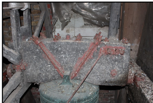
This photo shows the headstock of number seven bell. This bell has probably the least wear of all eight but will still need repairing in the near future.

Our aim is to have the bells removed and taken away to have the remaining six headstocks replaced. Whilst the bells are away, we would have them tuned and new wheels made to replace the old wheels, most dating back to 1879 when the bells were installed in St. Botolph's. We would have the wooden frame removed from the tower and a new steel frame fabricated and installed. While the bell chamber is completely empty, it will give us a great opportunity to repair the louvres and make them bird-proof. The bells would then be rehung in the new frame