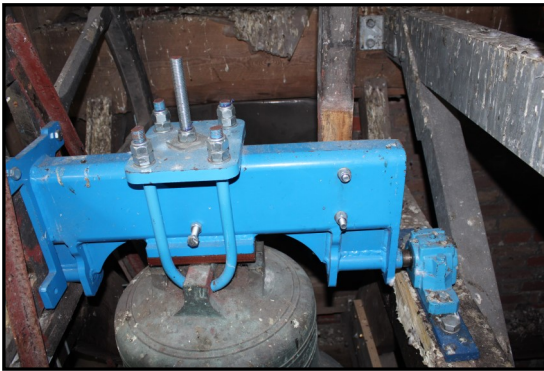
This photo shows the new headstock and bearings fitted to bell number four. It is hoped that, if we can fund a new frame for the bells, the two new headstocks can be reused in the new frame.

This is clearly a lot of money to raise and we are now starting our fundraising for the project. If any of our readers have any experience of fundraising, we would love to hear from you. Equally, if any of our readers would be able to help organise fund raising events,