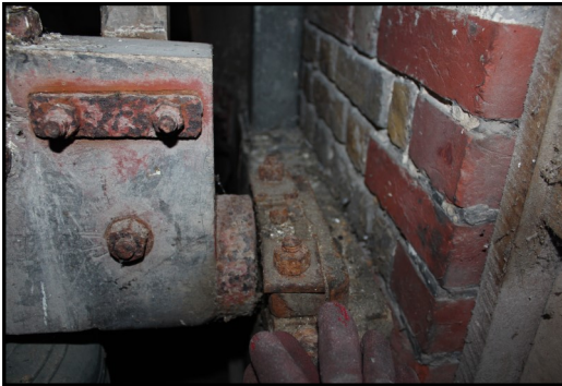
This photo shows the headstock and one bearing of bell number two. The gudgeon, not visible, protrudes from the headstock into the bearing. Wear on the gudgeons have made them very loose in the bearing.

Since the last article on the bells was in the November/December edition, we thought it was time for an update and what our plans moving forward are. As a recap, an inspection carried out in March 2024 advised us to stop ringing bells 4 and 5 with immediate effect. This was due to a high risk of the gudgeons failing (the gudgeons are metal pins that fit into