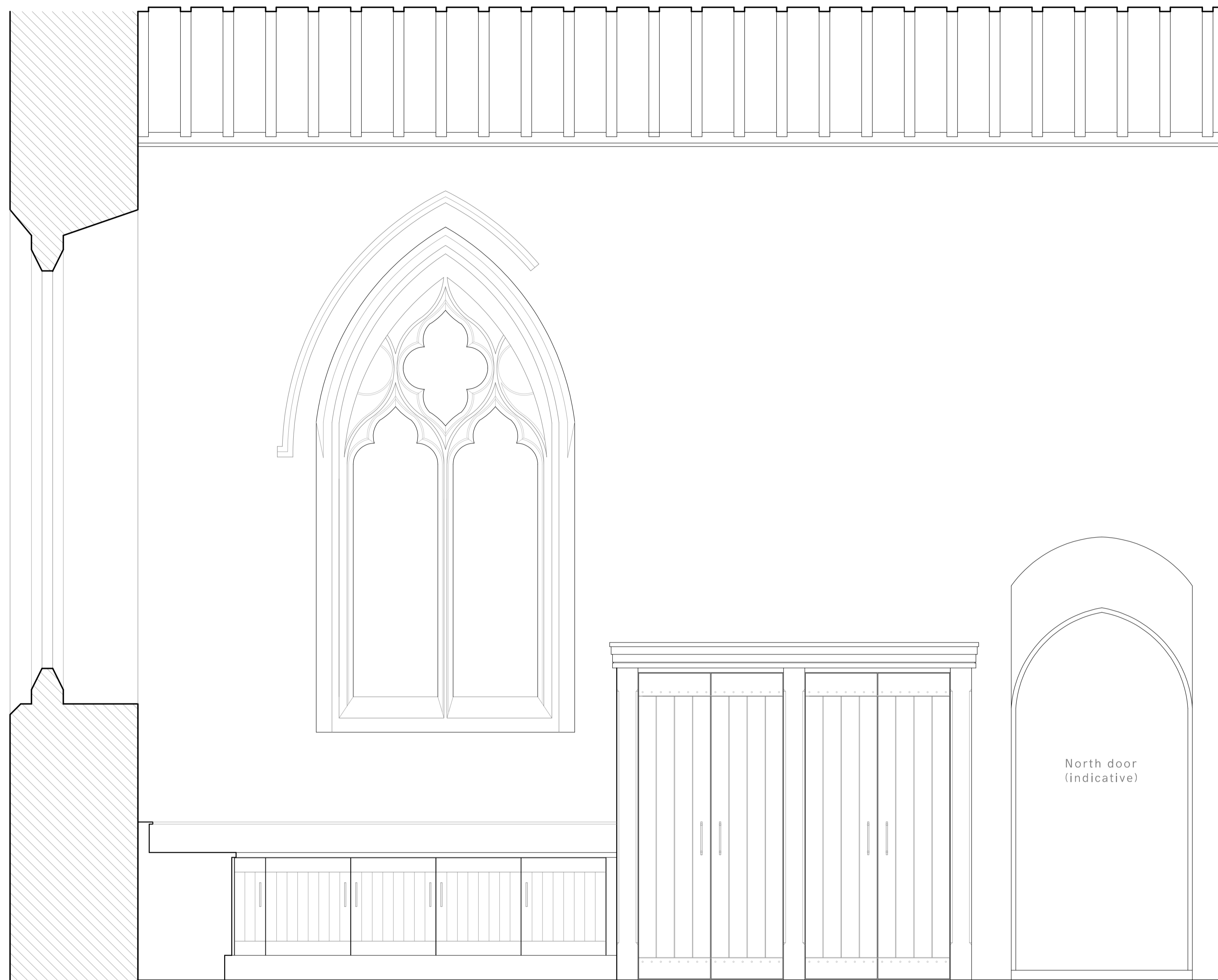
1:20 ELEVATION A-A AS PROPOSEED