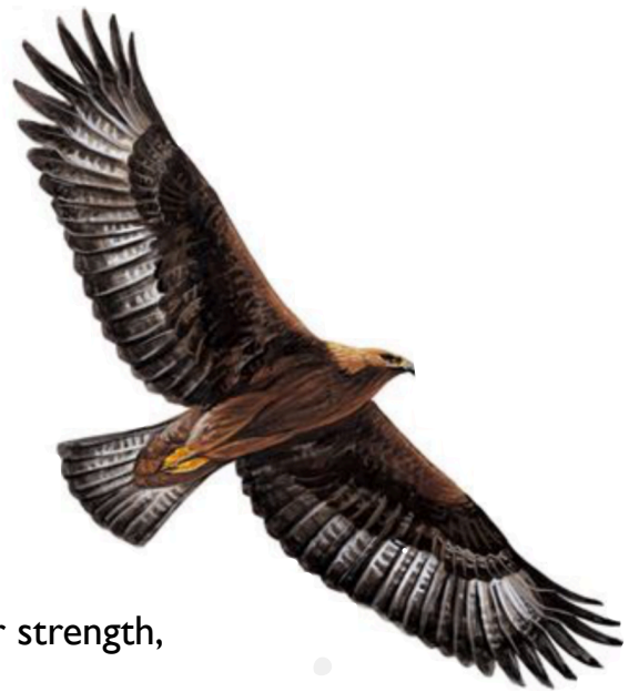
Golden Eagle.

31 but those who wait for the Lord shall renew their strength, they shall mount up with wings like eagles, they shall run and not be weary, they shall walk and not faint.