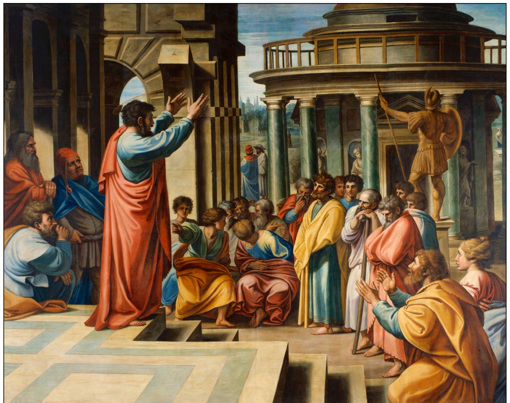
Sir James Thornhill, Paul preaching in the Areopagus, 1729-31

29 Since we are God's offspring, we ought not to think that the deity is like