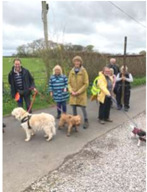
Good Friday Walk 2026