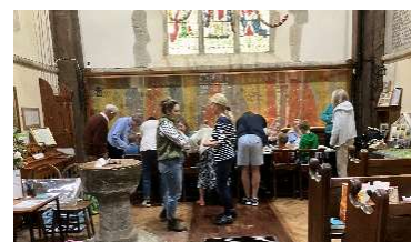
Funday@4 attendance was steady during 2025 – the PCC would like to encourage its growth in the future