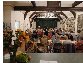
Harvest Supper 2025

The object of the Pop-up stall is two-fold: to generate funds for the Church but also, very importantly, to be an outreach to talk to people in the village and remind them that the Church is here. The stall provides information about upcoming Church services and events, visitors are also welcome to bring prayer requests to the team. It is a visible Church presence in the centre of the community.