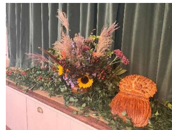
Harvest Supper decorations

The Harvest Supper was not only fundraising success but was also a superb outreach opportunity, with over 70 attendees from within the parish and wider community. It provided a net income of approximately £1,200.