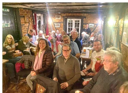
Advent Course 2025 at The Sun Inn

Following on from the success of Christianity Explored (18 attendees) in 2024, lay-led Church pub ministry events during 2025 followed a similar blueprint and attendances have grown inexorably. A total of 33 people (from Dunsfold and Hascombe) were registered for the Advent 2025 course. The pub ministry has succeeded in attracting people to meetings who didn't previously attend Church. Several have subsequently become regular members of the congregation and Church volunteers. Eight laypersons helped to lead the pub ministry sessions in 2025.