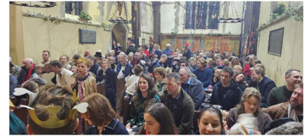
Christmas Eve Crib Service

All are welcome to attend our worship services in the parish. Work that commenced in the interregnum relating to Church mission in Dunsfold and the growth of both the Church in our community and service attendances has continued.