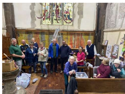
Church tidy workparty – November 2025