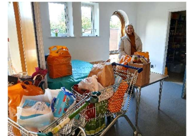
Harvest Festival donations

Worship services in the parish during 2025 were also enhanced by Church bellringing from the growing band of bellringers who serve both Dunsfold and Hascombe. The search for a regular organist for Dunsfold services also