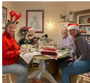
Pop-up stall – Christmas crafting

This year saw the Pop-up move away from bric-a-bric (in line with changing tastes and demographic), and relying more on homemade produce, crafts and plants. Whilst this new focus is popular with customers, it is more labour intensive – relying on volunteer time and money so that there is no cost or expense incurred by the Church.