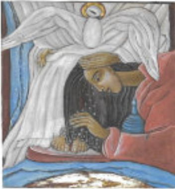
Mary wipes Jesus' feet with her hair.