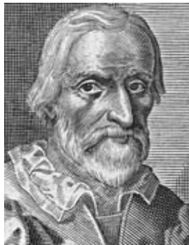
Portrait of Saint Bede

St Bede - also known as the Venerable Bede - is widely regarded as the greatest of all the Anglo-Saxon scholars. He wrote around 40 books mainly dealing with theology and history.