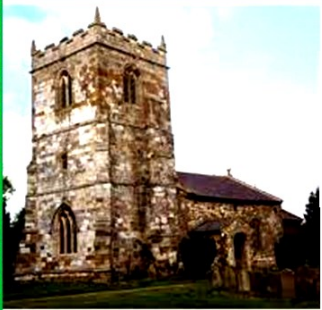
St. Adelwolds Alvingham