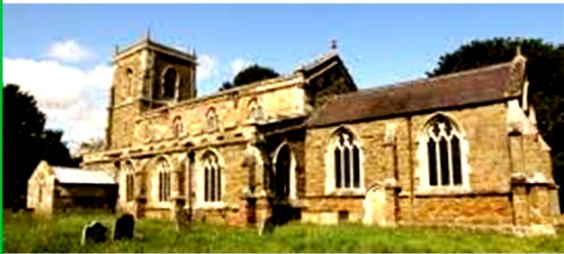
St. Edith's Grimoldby