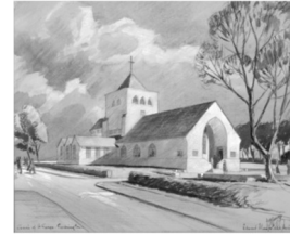
St George's, Goodrington

29th March 2026 Palm Sunday Holy Week and Easter