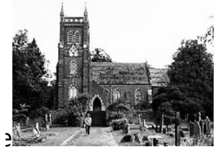
St Mary's, Collaton St Mary

29th March 2026 Palm Sunday Holy Week and Easter