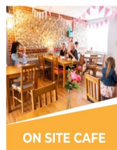
ON SITE CAFE