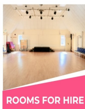
ROOMS FOR HIRE