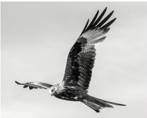
Black Winged Kite: Jon Kelf

The most exciting bird on Barton Broad during the past 2 months was a Slavonian Grebe which I was lucky enough to see on the 22 nd December, albeit at a long distance. This species is one of the mid-sized grebes in that it is substantially smaller than a Great Crested Grebe but much larger than our familiar Little Grebe. In summer plumage it is a spectacular looking bird with red, black and yellow colouration but in its winter plumage it is much plainer being mainly black and white with a red coloured eye. Slavonian Grebes are known as Horned Grebes in North America as they raise their yellow head tufts in their display dance which involves a race across the surface of the water carrying beaks full of weed. There has been a small breeding population of these birds in the lochs of the Scottish Highlands since they first bred in the UK in 1910. Numbers peaked at around 80 pairs in 1980 but since the mid-1990s they have dropped to around 20 pairs in 2024. They spend the winter around the coast of the UK mostly along the south and east coasts but will move into inland waterways if the weather becomes too harsh for them on the estuaries or sea. Birds of Norfolk records them as scarce winter visitors with only a few recorded at inland sites each year. In March 1979 there were 4 to 5 on Hickling Broad and in March 1996 there were 3 on Horsey Mere but peak counts for Norfolk are generally around the area of the Wash.