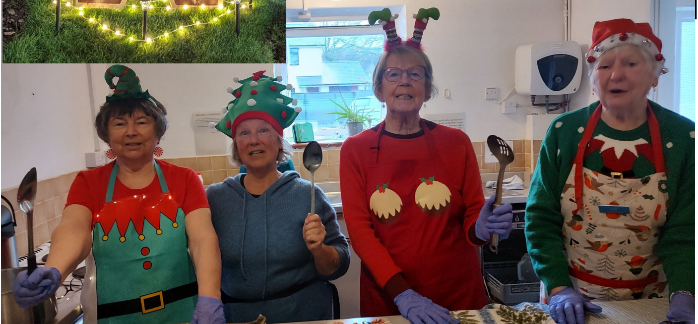
Luncheon Club Christmas dinner