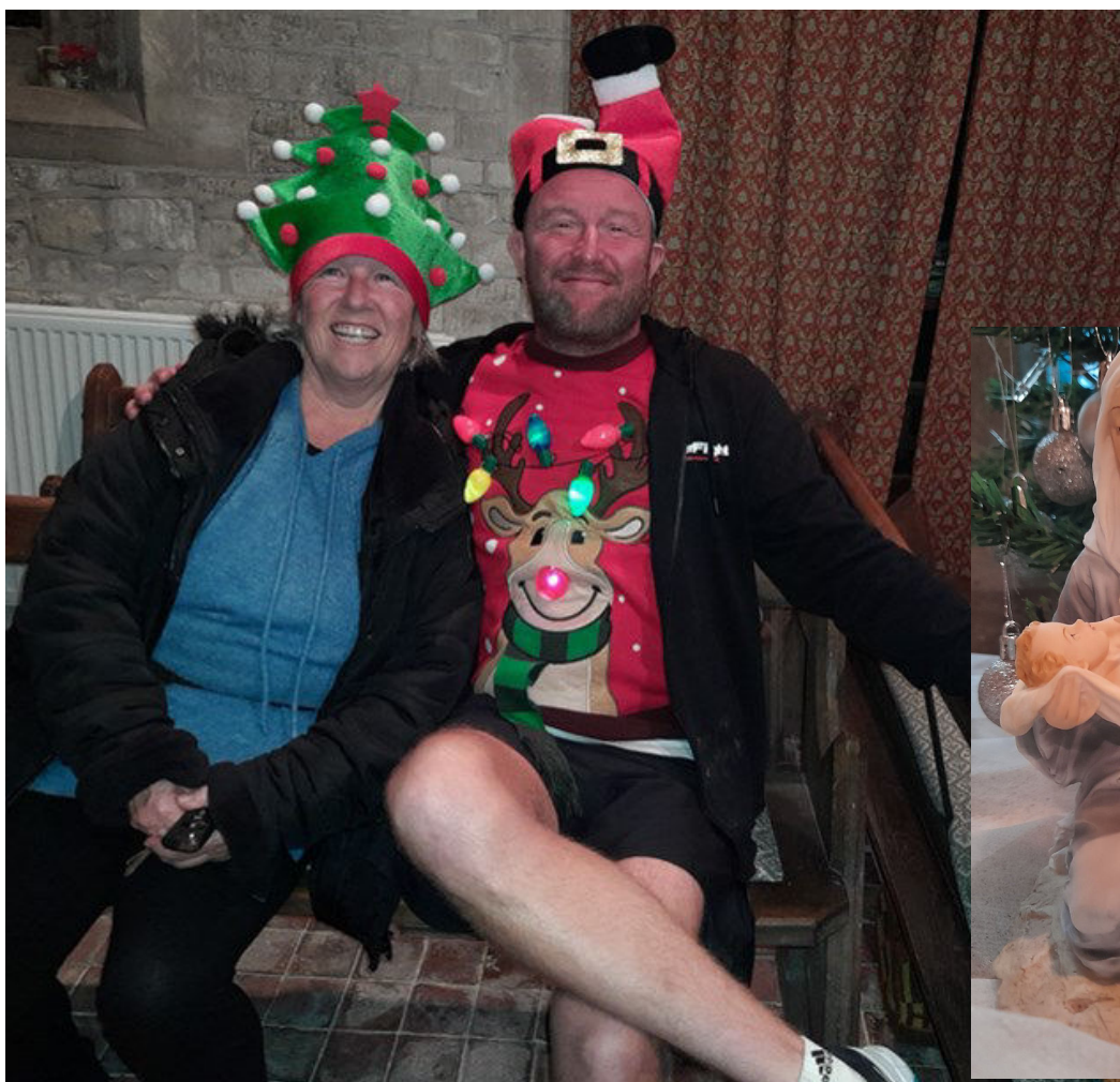
Crowell Carols 19th December