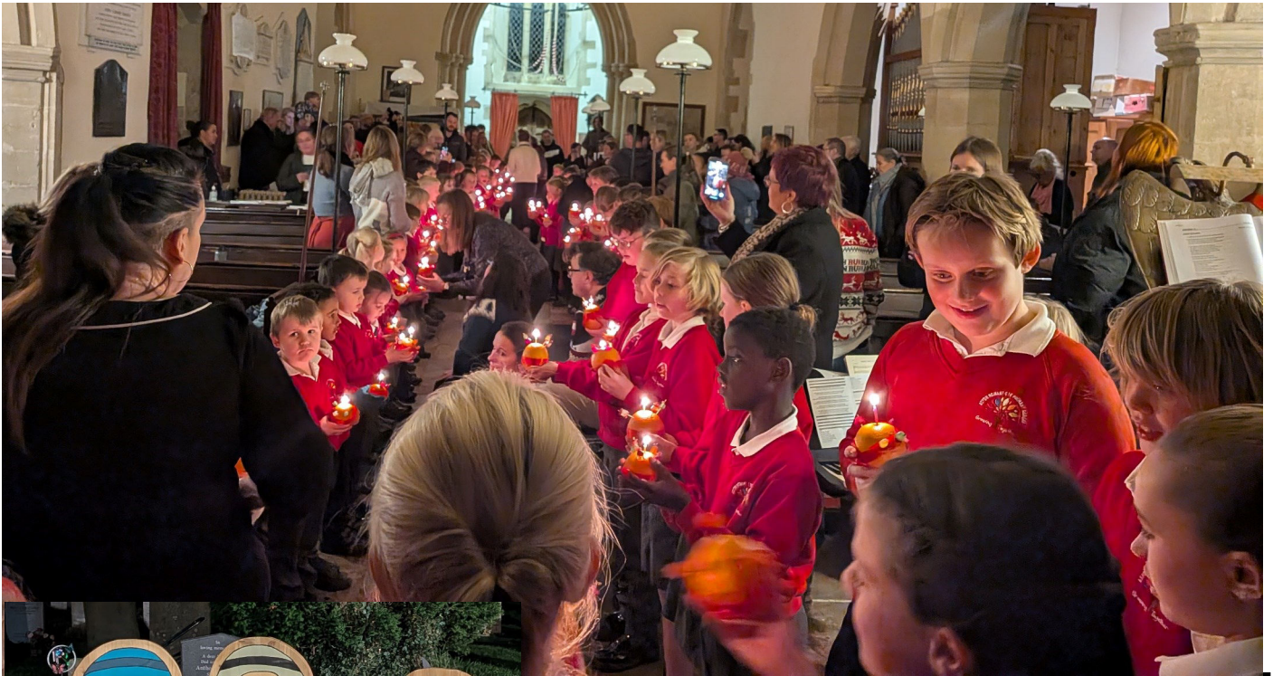
School Christingle at Aston Rowant