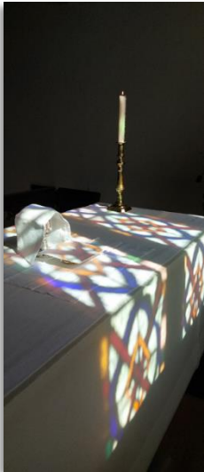
The alter laid for Holy Communion at St. Anne's Church, Epwell