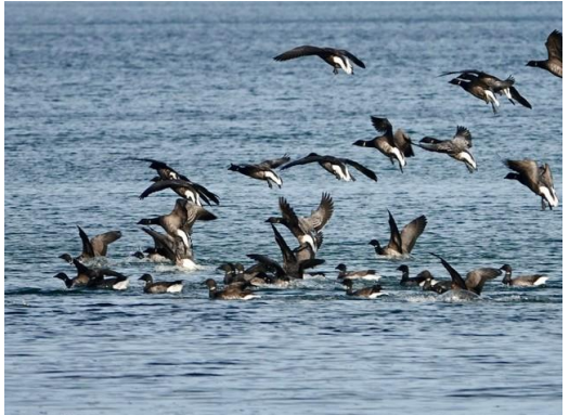
(Photos of dark-bellied brent geese at Middle Beach on New Years Day)

Please share your photos - email sharonwestman@gmail.com