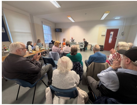
Previous Open Group—Reading Accor-dion Group October 2025

Wednesday 9th December 3-4pm Downshire Room for the Christmas Cream Tea (£4)