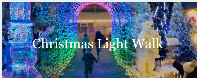
Christmas Light Walk