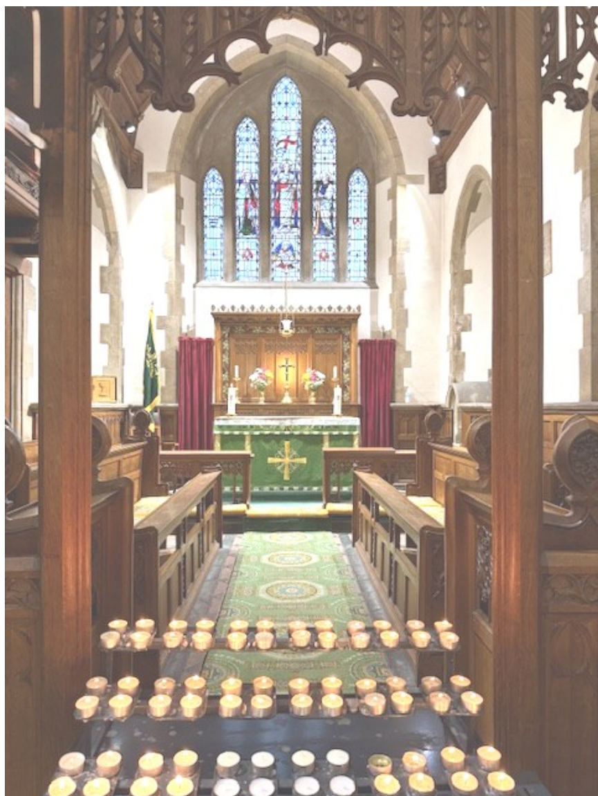
The image is our church during the 'Service of Loving Remembrance', showing the candles lit in memory.