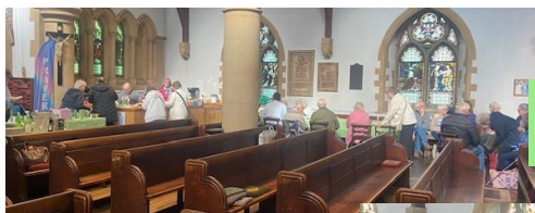
Tours at All Saints Church

It was wonderful to see so many people in our churches that had never been into our church buildings before, at the same time as raising much needed funds for Macmillan cancer support.