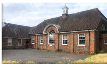
All Saints Hall, Downshire Sq, RG1 6NH

The Downshire Room at All Saints is also available separately for smaller groups.