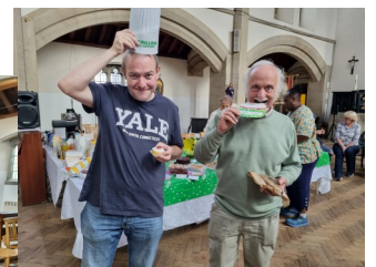
Fun at St Mark's Church

We managed to raise a phenomenal £316.50 at St Mark's Church and a further £420 at All Saints Church. A truly wonderful day.