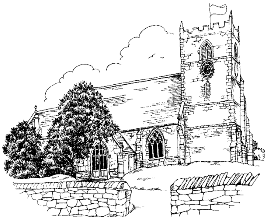
St. Philip & St. James Church, Ratby

Ratby Parish Church is committed to the safeguarding, care and nurture of everyone within our community.