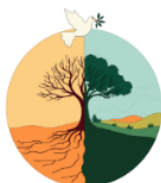
Garden of Peace Isaiah 32:14-18

Creationtide is the period in the annual church calendar, from 1 st September to 4 th October, dedicated to God as Creator and Sustainer of all life. It's a month of unity, when Christians around the world celebrate the beauty and wonder of creation and commit to caring for our common home. This year, we are called to be peacemakers with creation, all people, and God, based on Isaiah 32:14-18.