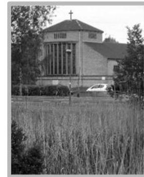
St Michael & All Angels