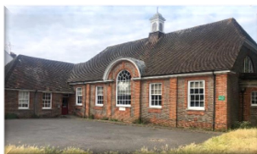
All Saints Hall, Downshire Sq, RG1 6NH

The Downshire Room at All Saints is also available separately for smaller groups.