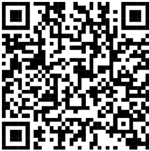
OHCT GoodHub Main Page QR Code