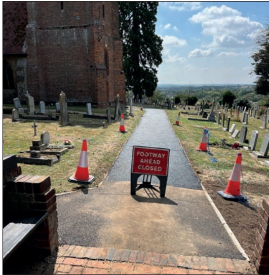
The new path at St Margaret's.