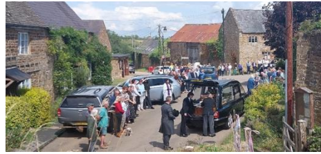
Parishioners and friends lined the village to say a final farewell