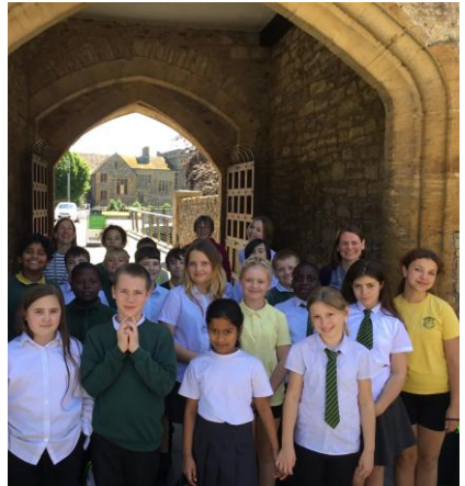
Year 6 pupils on a trip to The Somerset Museum in Taunton

The Coffee Morning in St Peter's Church on 13 th September will be raising money to buy Bibles and Books for the school. Please come along and support them.