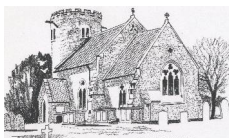
St. Andrew's Kilverstone