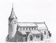
All Saints', Croxton