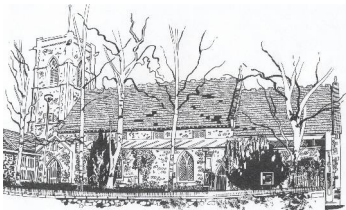
St. Cuthbert's, Thetford