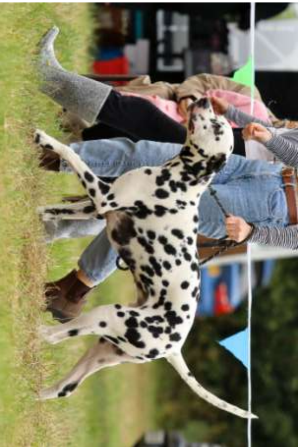
From the Fawley Farm Horse & Dog Show: 'Proudly Striding Out'