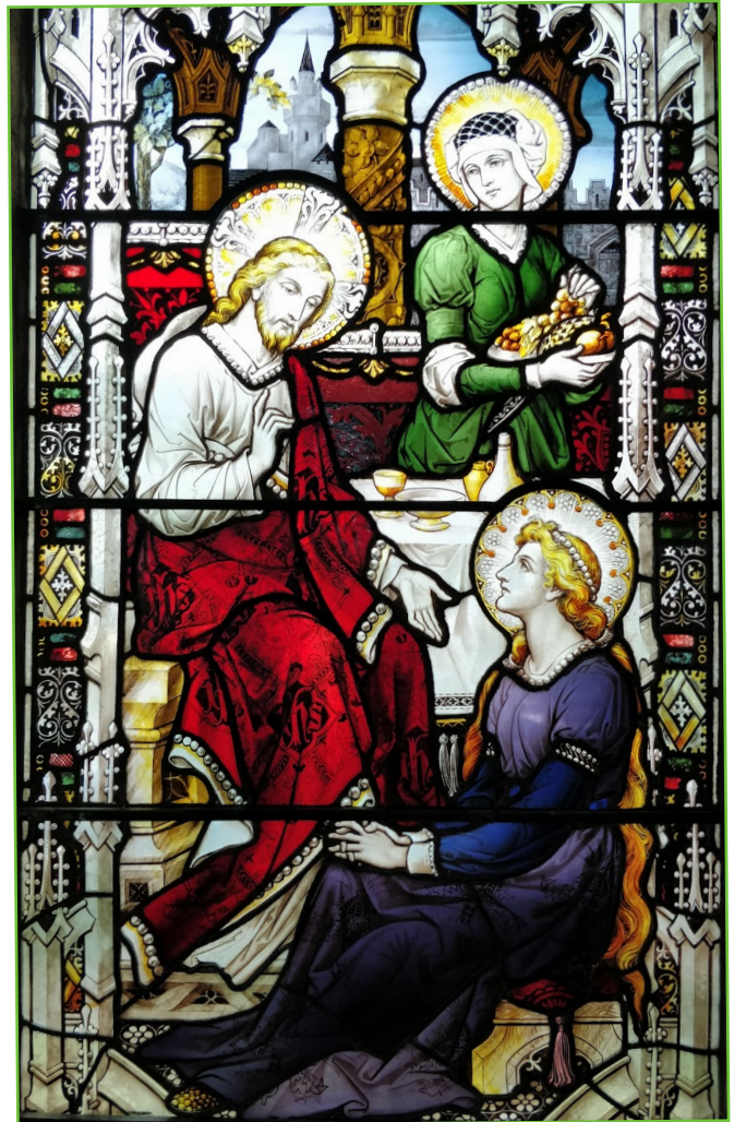
Detail from the Martha and Mary window, Austwick Church

38 Now as they went on their way, he entered a certain village, where a woman named Martha welcomed him into her home. 39 She had a sister named Mary, who sat at the Lord's feet and listened to what he was saying. 40 But Martha was distracted by her many tasks; so she came to him and