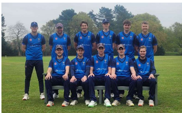
1 st XI in Sponsored Kit

24 th May Winterton CC Home 31 st May Gt Yarmouth CC Away 7 th June Blundeston & Somerleyton Home 14 th June Blundeston & Somerleyton Away 21 st June Norwich Bystanders CC Home 28 th June Lowestoft Town CC Away