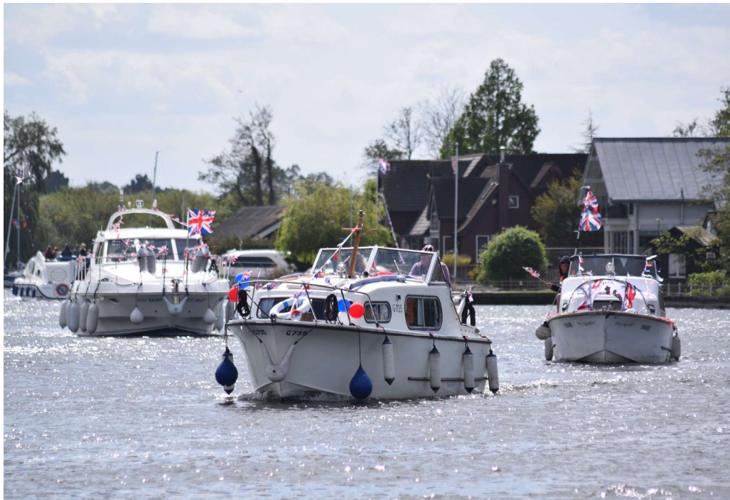
VE Day Flotilla