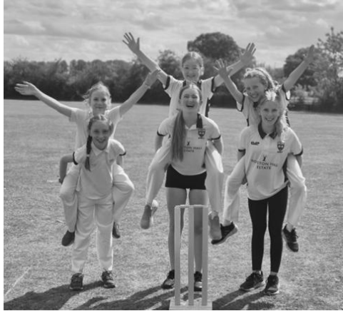
Our newly formed girls' team