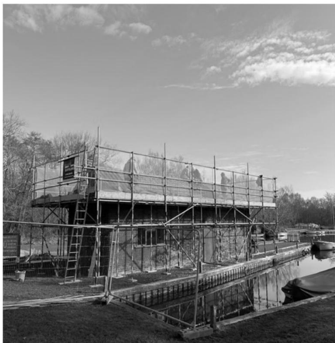
Scaffolding up and the work begins

As many of you will have noticed The Black Shed at Barton Turf Staithe has recently undergone an external makeover. In March, Barton Turf & Irstead Parish Council undertook the 1 st stage of its plan to renovate and restore the Black Shed. Under the expert guidance and workmanship of Andrew Lodge all the old roof tiles were stripped off; new joists replaced where necessary; new underlay and battens fitted and new traditional clay pantiles installed. The whole building was then hand brushed down and the wooden windowsills sandpapered after which the building was spray treated and repointed where necessary. Several days later, litres of lovely new special black paint arrived, and a second team of volunteers cheerfully painted the whole building with two coats, starting from the top and working downwards as the scaffolding was dropped.