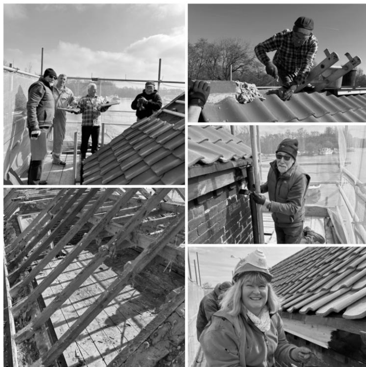
Some of the team at work!

doing. We still have some drainage works to complete and then the building will be totally waterproof. We can then move on to Phase 2, the internal refurbishment, at a future date.