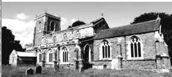
St. Edith's Grimoldby