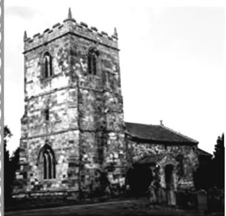
St. Adelwolds Alvingham