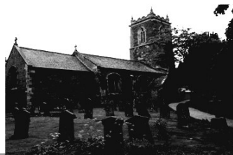
St. Leonard's South Cockerington