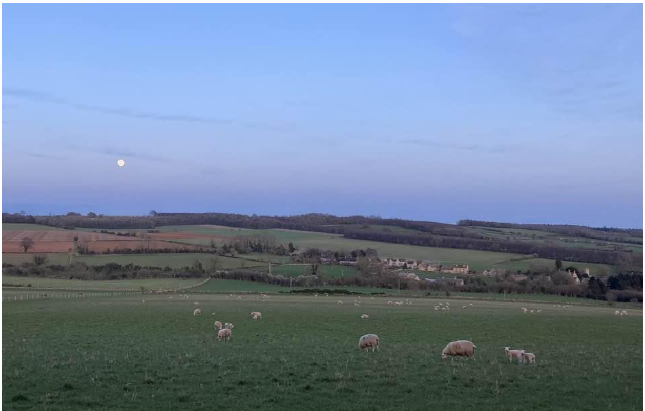
on the Walk of Witness on Sunday 24 March 2024