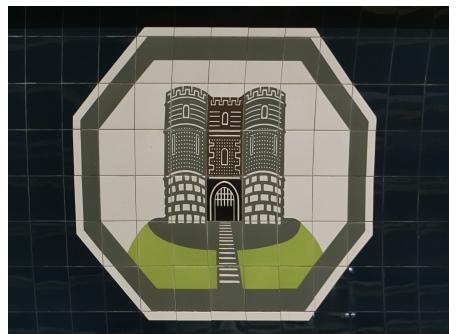
Edward Bawden's logos at Tottenham Hale Station and at Highbury & Islington Station