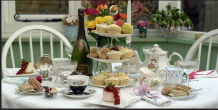
wedding breakfast • vintage teas