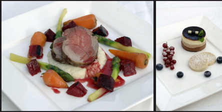
barbecues • cocktail parties • picnics