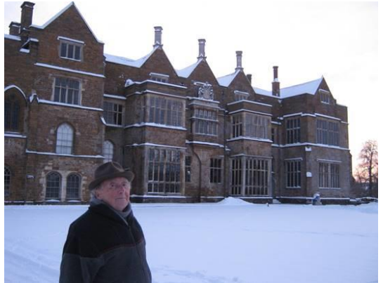
At Broughton Castle, 2010