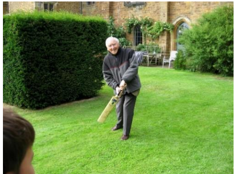
Cricket with his grandson, 2006