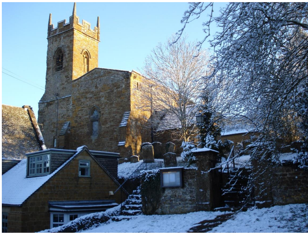
St. Martin's Church, Shutford