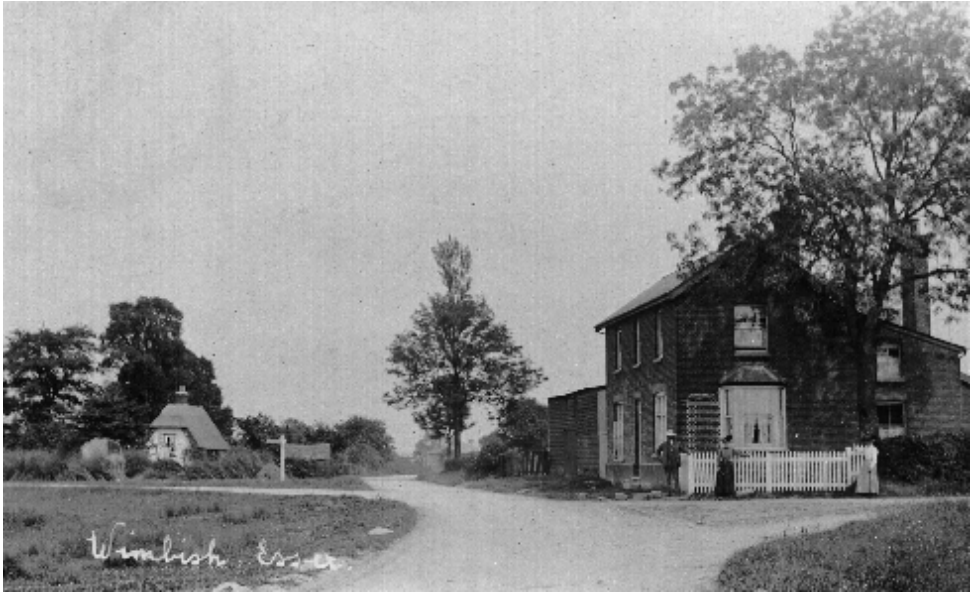
Rowney Corner early 1900s and today