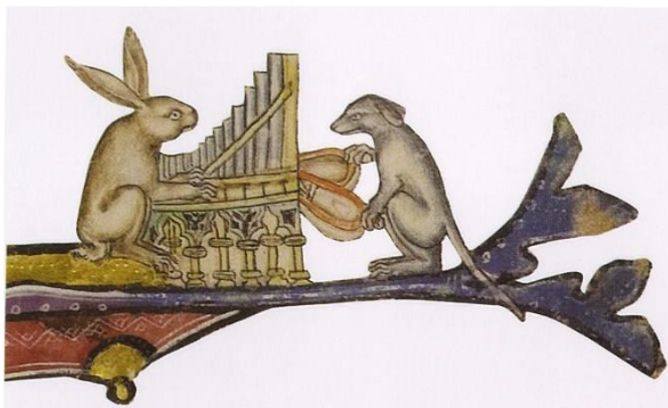
From the margin of a medieval manuscript.