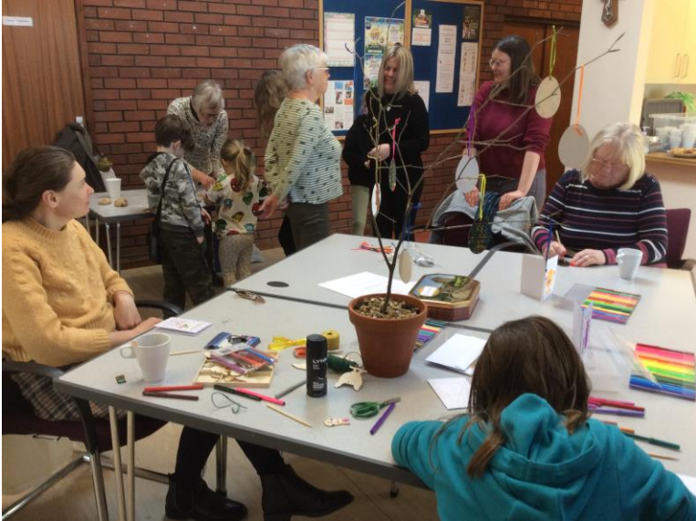
Good Friday Workshop 2023.