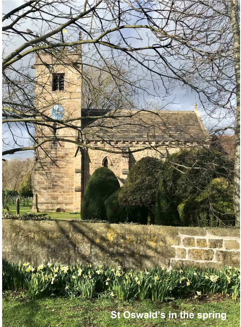
St Oswald's in the spring

NEWS FROM THE PARISH OF COLLINGHAM WITH HAREWOOD & LINTON