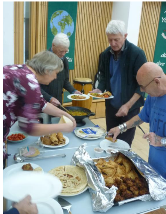
Harvest 'Bring and Share' Lunch