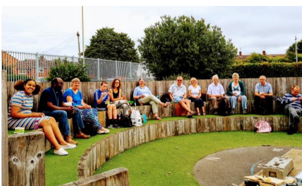
'Bring and eat' lunch, Sunday 24 th July