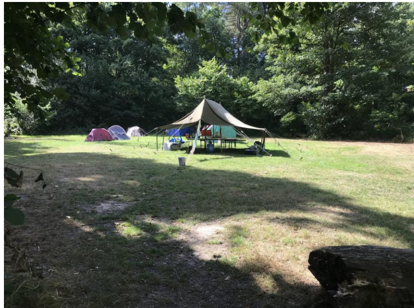
Camping at John's Lee Wood

Numbers remain relatively low at 7-9 but not less than we have seen in a single section at times in recent years. We are a little anxious about not meeting the minimum numbers looked for by Scout Association policy but have historically been viewed favourably related to our commitment to function in a type of area less inhabited by scout groups.