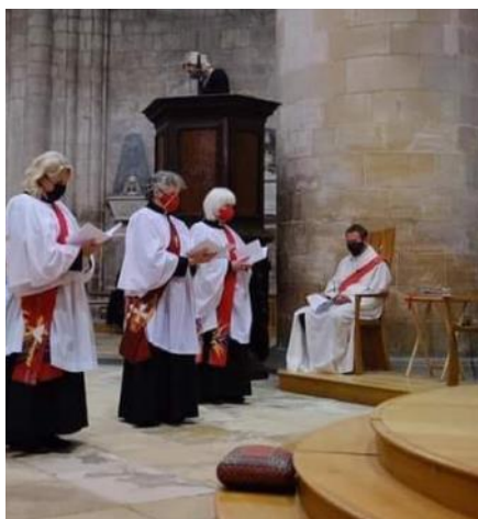
June 2021—ordained priest at Gloucester cathedral, and then presiding at Holy Communion for the first time at St. Paul's

We look back here at some of the milestones of her first six months as an ordained priest, and remember the many contributions she has already made to our life and worship in the benefice;