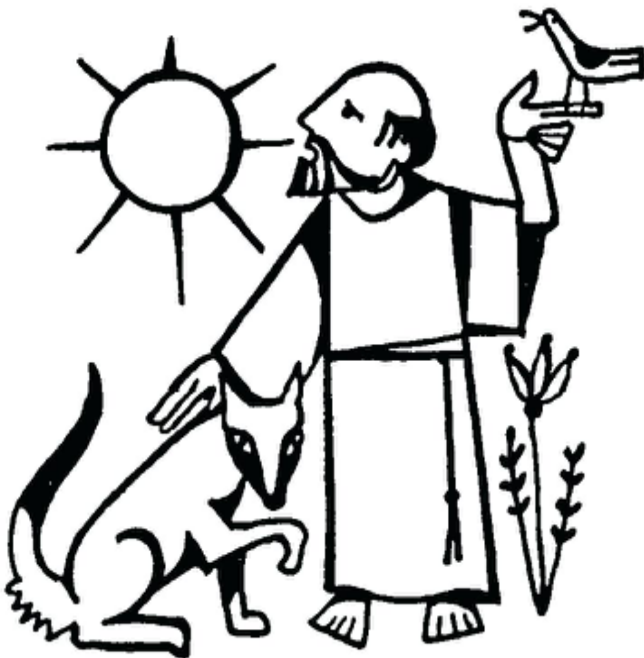
St Francis of Assisi