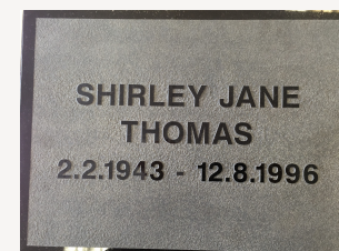
Sample marker stone with individual inscription.

In this part of the churchyard there is a central monument (pictured left) as the main focus for remembering and giving thanks. An individual marker stone may also be installed on a plot once permission has been sought from the parish priest. The marker stones permitted are 9" x 9" granite stone tablets specified by the Parochial Church Council. Memorial application forms are available from the benefice office or from the Lichfield Diocese website. NO stone can be installed without permission from the parish priest.