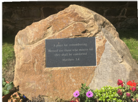
The central memorial in the Area for the Burial of Cremated Remains at St. Mary Magdalene.

Every parish church wishes its churchyard to be a place of peace and refuge for those who mourn, and to be a place where the mortal remains of their loved ones can rest safely. We hope such provision will be an expression of the care and love the church seeks to extend to the whole community and underline its belief that the welfare of both the living and departed is important to God.